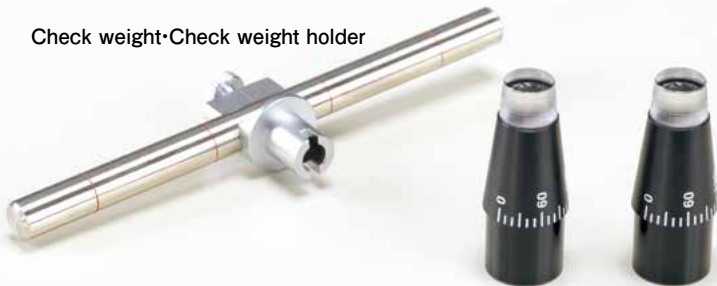
TAKAGI measuring prism (Product Code: S12-18)